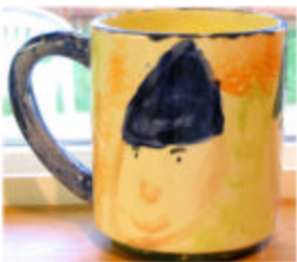
Are you missing me?

Email is preferred, but you can also mail your submission to: Communications Director, PO Box 512, Woodinville WA 98083. All submissions will be edited for length and content.