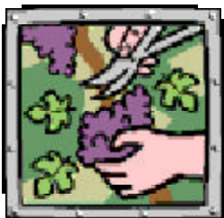
Two Clean-Up Days are scheduled this year.